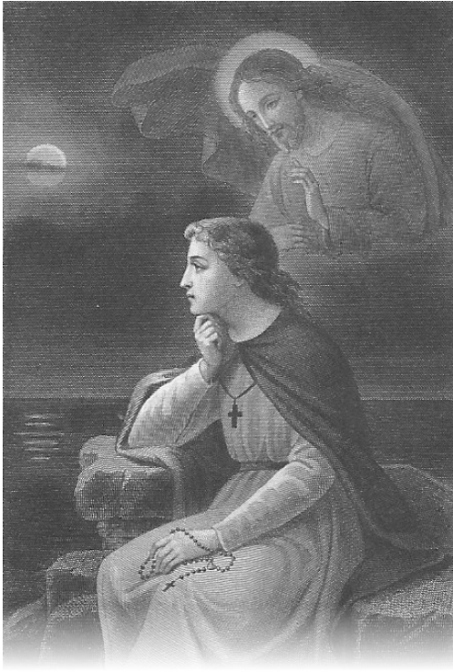
A PRAYER AGAINST DEPRESSION By St. Ignatius of Loyola

O Christ Jesus, when all is darkness and I feel weak and helpless, give me the sense of Your presence, Your love, and Your strength. Help me to have perfect trust in Your protecting love and strengthening power, so that nothing may frighten or worry me, for, living close to You, I shall see Your hand, Your purpose, Your will through all things. Amen.